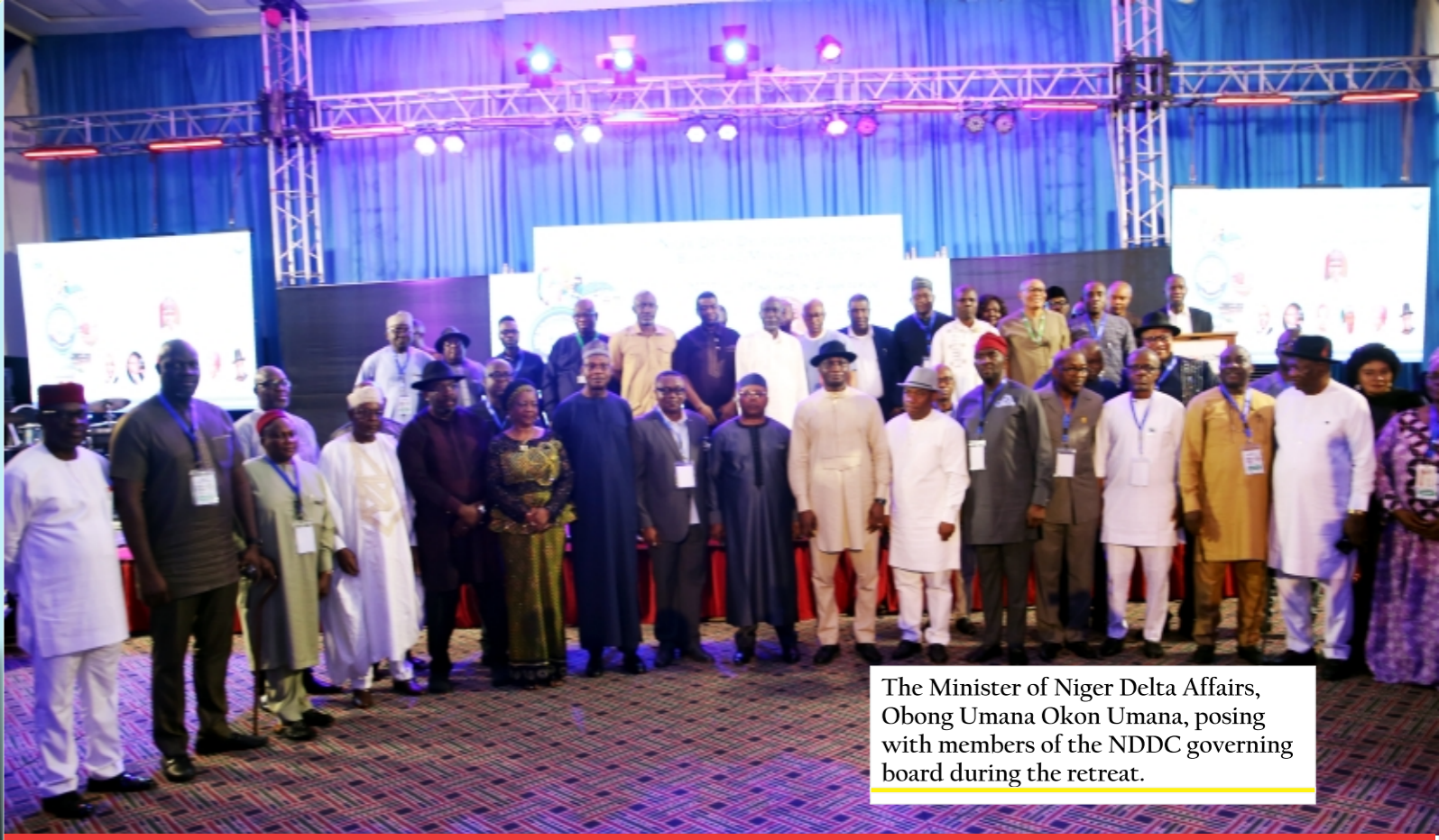
The Minister of Niger Delta Affairs, Obong Umana Okon Umana, posing with members of the NDDC governing board during the retreat.